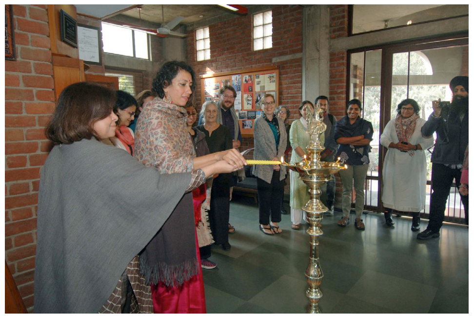
Welcoming Lamp Lighting at the AIIS Center at Gurugram January 12, 2018

On the second day, participants were transported to our own AIIS campus in Gurugram, where they were greeted with the traditional five-wicked brass oil lamp and beautiful floor designs made of flower petals. The remaining six presentations were given in the Board Room on the ground floor, mentored by Professors Pinch and Ramaswamy. Once again, these highlighted the diverse interests and extraordinary linguistic preparation of our current Junior Fellows as they pursue both archival and field researchwhether in Urdu and Persian archives in eastern Uttar Pradesh, royal museum collections in Kerala, the contested coalfields of Jharkhand, or sex education classes in New Delhi schools. Following a lunch served in the upstairs dining room with its adjacent roof garden, the Junior Fellows' day concluded with a tour of the libraries and archives of the Institute's two Research Centers, with the exchange of phone numbers and e-mail addresses, and with the parting of new friends—some of whom, now that they are familiar with one another's work, may collaborate in future panels at conferences and annual meetings.