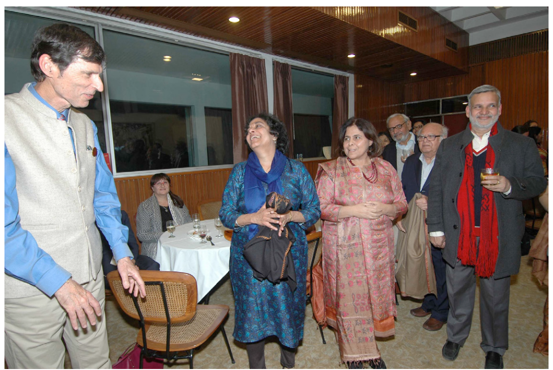
Mirthful Moment at the AIIS Dinner Reception on January 11, 2018