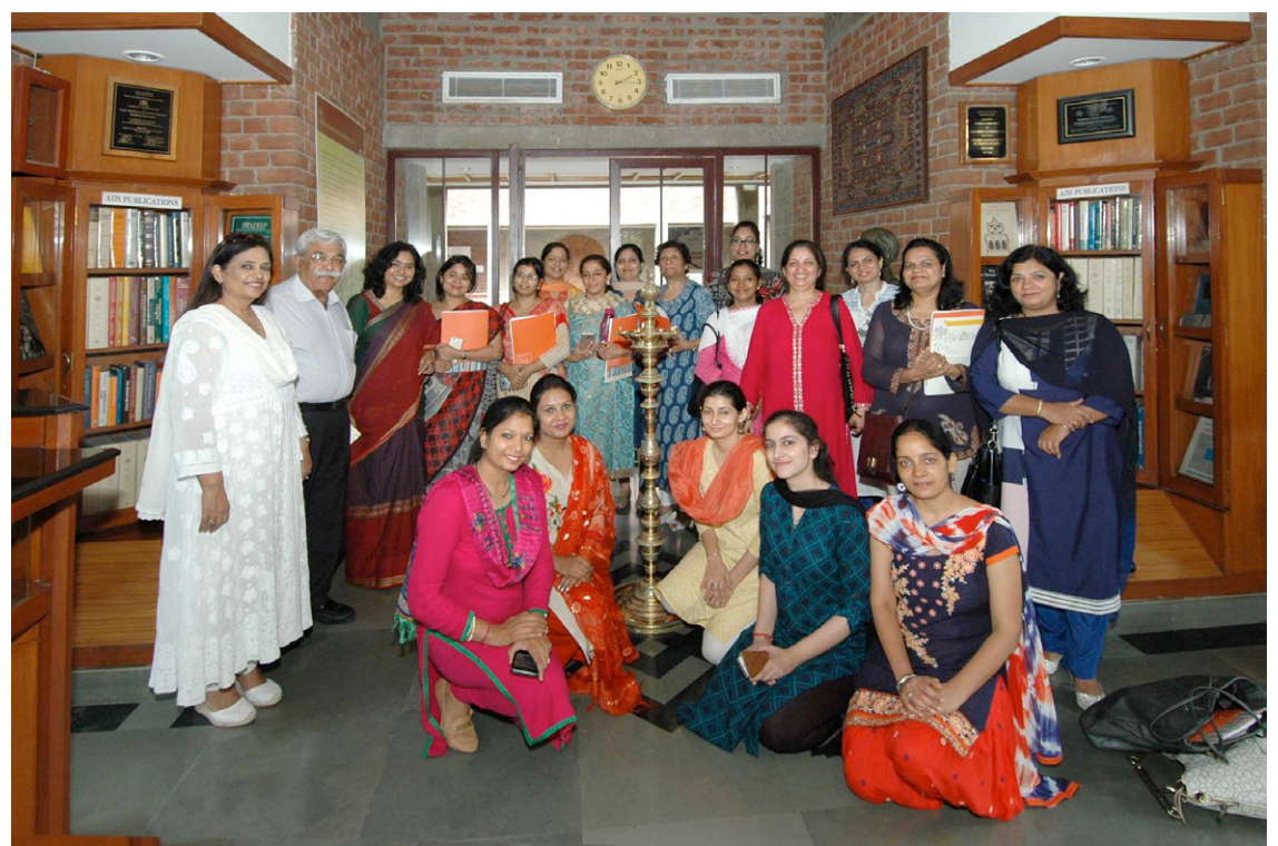
INTACH Teacher Training Participants June 29, 2017

On June 29, 2017 CAA hosted a teacher training workshop for the Indian National Trust for Art and Cultural Heritage (INTACH). The purpose of the workshop was to acquaint the teachers with the research and teaching resources of the Center. The 35 participants came from various private schools in the Gurugram area where they teach social studies to middle and high school students. The program was intended to enable them to use the CAA visual archives and library as resources for their classes. They were also introduced to the Virtual Museum of Images and Sounds (VMIS) web site for free access to CAA materials.