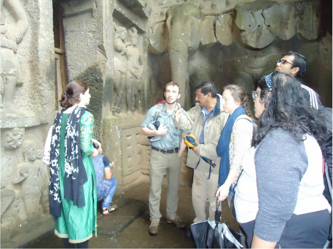
AIIS Summer 2017 Sanskrit Students Visit Karla Caves